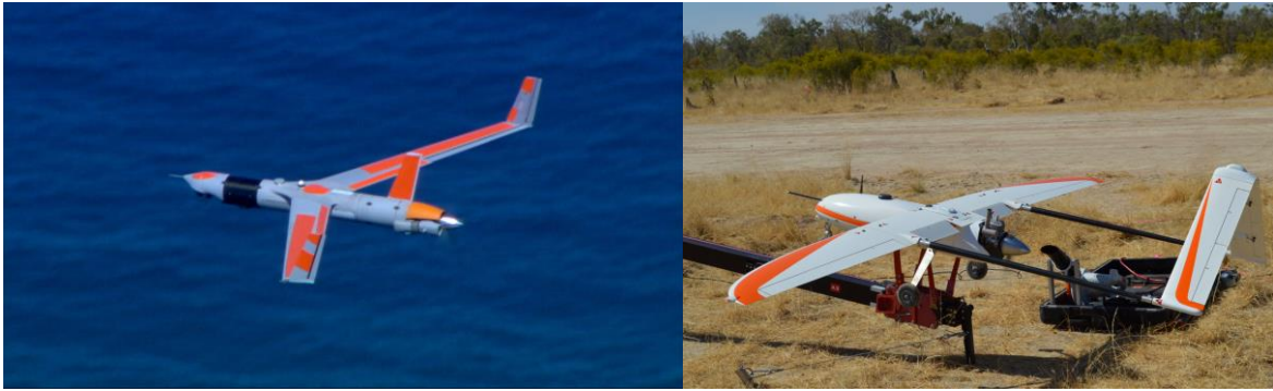
ScanEagle RPA (left) and CT220 RPA (right) – 3.1 metre wingspan, cruise speed 45 – 60 kts