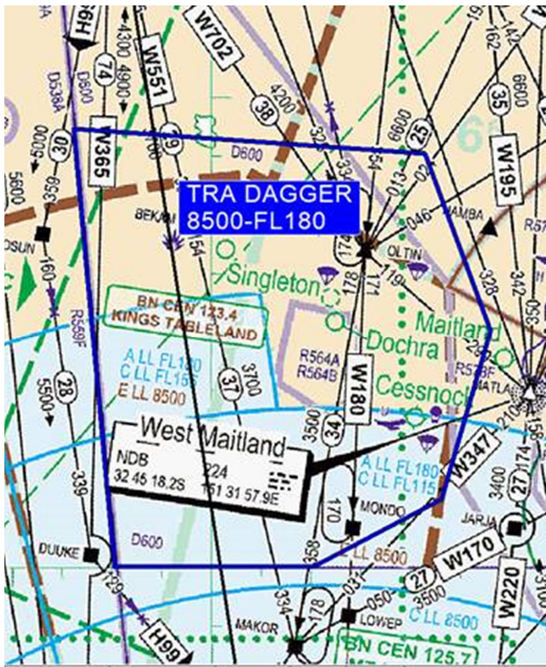
Figure 1. TRA Dagger